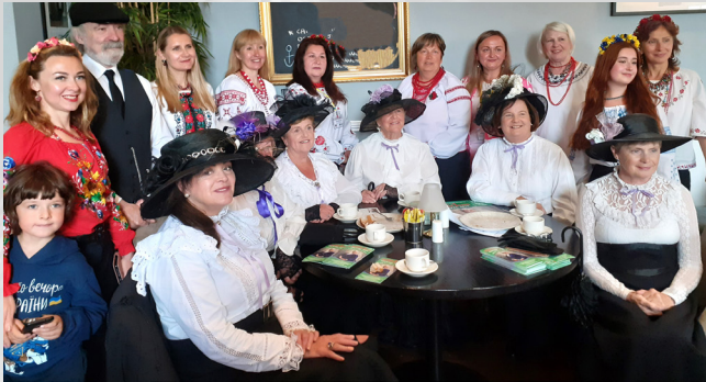
Kalyna Cork Ukrainian Choir and Cobh Animation at 2023 festival.